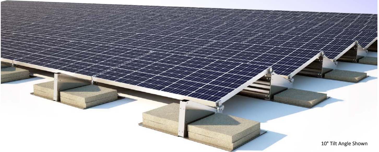
10° Tilt Angle Shown

IronRidge Ballasted Roof Mount System, the simplest on the market, is the best choice for large flat roofs that require no roof penetration