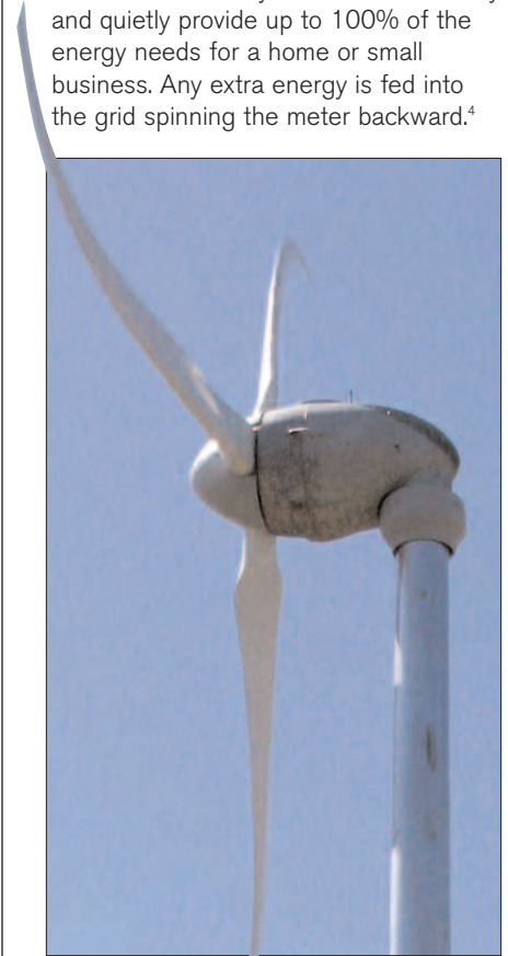
UL Certification and CE Certification Pending

Skystream is available on towers ranging from 35' (10.67m) to 110' (33.5m). 2 Its universal inverter will deliver power compatible with any utility grid from 110-240 VAC. 3 Skystream will efficiently and quietly provide up to 100% of the energy needs for a home or small business. Any extra energy is fed into the grid spinning the meter backward. 4