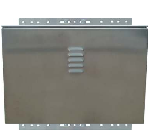
Mounts on wall using 4 lag bolts (Bolts not included)