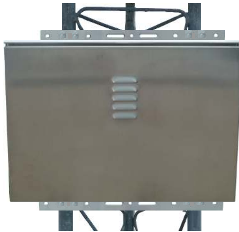
Mounts to ROHN25 tower using 4 u-bolts (Bolts not included)