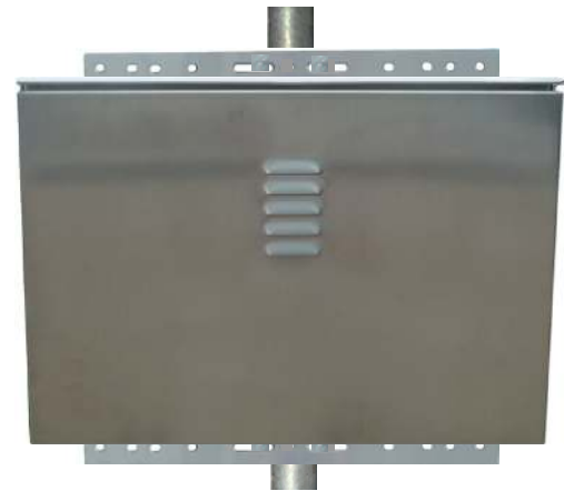
Mounts to 2-3" schedule 40 pole using 2 u-bolts (Bolts not included)