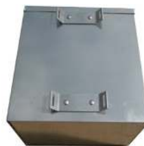
Banding available for unique mounting structures