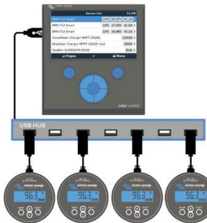
A maximum of four BMVs can be connected directly to a Color Control GX. Even more BMVs can be connected to a USB Hub for central monitoring.