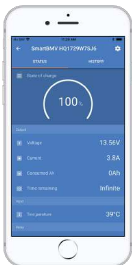
See the VictronConnect BMV app Discovery Sheet for more screenshots