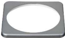
BMV bezel square